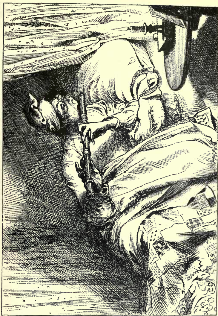
THE AIR WAS, "AWAY WITH MELANCHOLY."